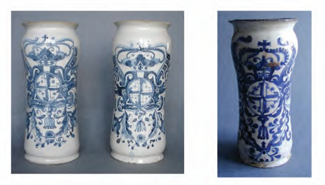
Fig. 6 – Pair cf glazed earthenware albarellos with the shield cf the Benedictine Order. 17th century. Biscainhos Museum. Inv. Nr. 2118 (a, b) MB.

Fig. 6a – Glazed earthenware albarello with the shield cf the Benedictine Order. Dimensions Height: 26.3cm; Diameter: mouth: 12.3cm;18th century. Inv. Nr. 678 MB. MB.