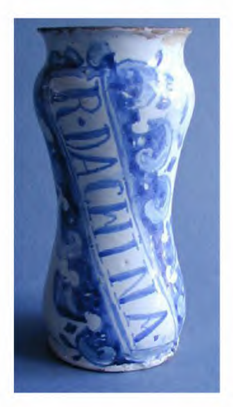
Fig. 9- Albarello with a diagonal script almost the entire piece's height, with the lettering V. MERCV. R. Dimensions :Height: 21 cm; Diameter: 11 cm; 17th/18th century (?), Inv. Nr. 426 Mb. Fig. 9a- Albarello labelled R. DA CHINA, framed & scrolls and plant mot fs. Dimensions. Height: 25 cm; Diameter mouth: 11.5 cm. 17th/18th centuries, Inv. Nr. 730 MB.

The Swiss physician Theophrastus von Hohenheim (Paracelsus) (1493-1541) searched for more effective remedies in inorganic salts, metals and minerals as part of his interest in alchemy, an ancient tradition dating back to Chinese and Arabic cultures [26] advising mercury formulated as an ointment in the treatment of syphilis [27]. Mercury was employed in Western medicine to treat skin diseases since the Middle Ages. However, although efficacious in controlling the cutaneous manifestations of the condition, physicians were aware of its toxicity [28].