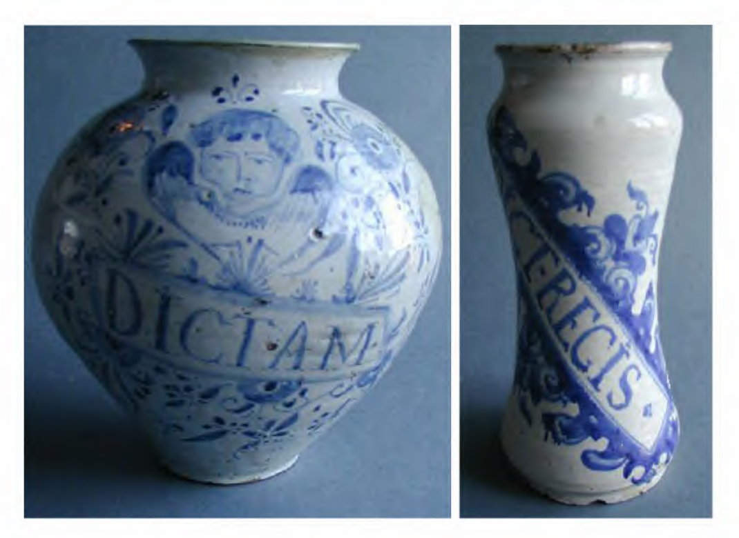
Fig. 10 –Pear-shaped apothecary jar decorated on the front with a rectangular diagonal caption with the lettering DICTAM surmounted by a winged head and surrounded by profuse decorations of phytomorphic elements. Dimensions: Height: 24 cm; Diameter mouth: 12.4 cm; Base: 8.6 cm. 17th century. Inv. Nr. 77MB. Fig. 10a – Albarello with the label DICT. REGIS outlined by scrolls and plant motifs. Dimensions: Height: 26.9 cm; Diameter mouth:9.9 cm. Late 17th /early 18th century (?). Inv. Nr. 521 MB.

It refers to a medicinal plant originally from Crete, used since ancient times to help women in labour. The winged female figure certainly alludes to the easing effect attributed to Dictamus . During the Middle Ages, dittany was an essential ingredient to produce Benedictine liquor [33 p133]. An albarello bears the inscription DICT. REGIS outlined by scrolls and plant motifs. Dictamus regis was the white dittany [18 p51] (Fig. 10a).