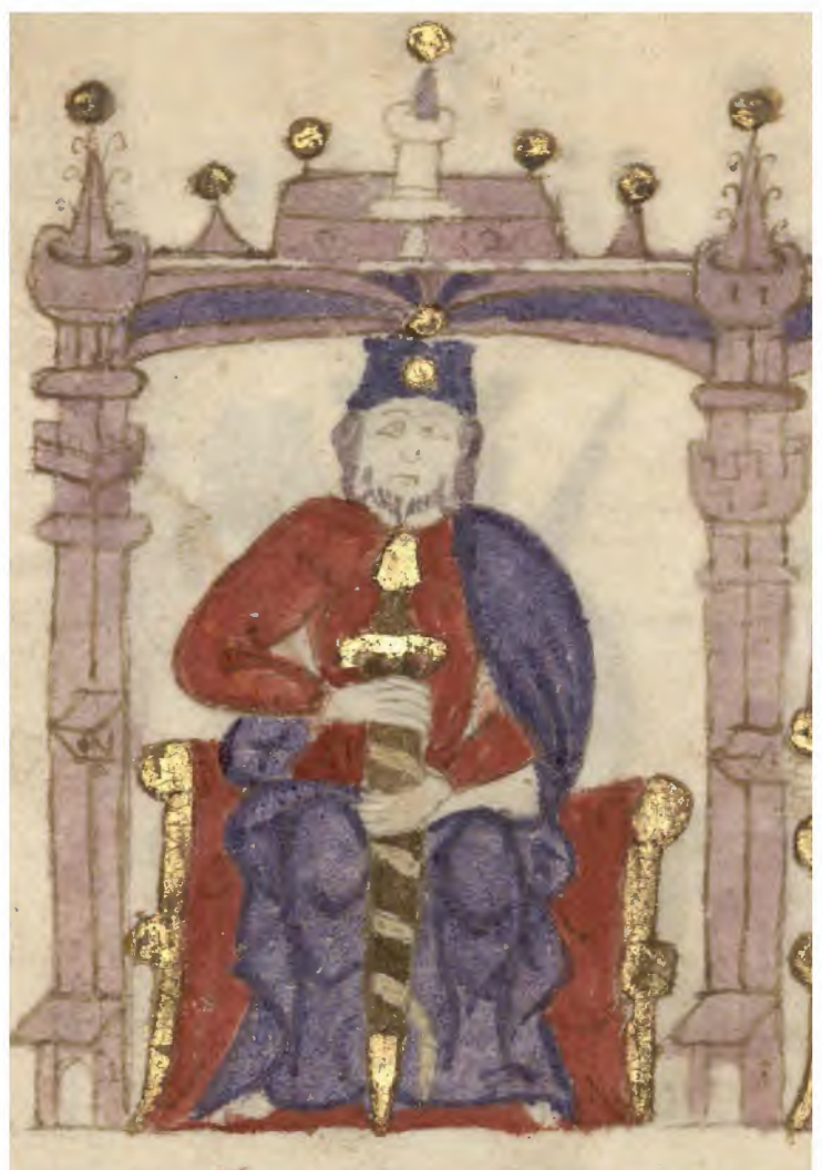
Fig. 2- Henry cf Burgundy, Count cf Portugal (c. 1312-c.1325).

The Monastery of S. Martinho de Tibães was founded in the mid-eleventh century, possibly by D. Paio Guterres da Silva (1070–1129), a Portuguese nobleman from the lineage of the sovereigns of León in 1077. He adopted the Rule of the Christian Saint Benedict of Nursia (480–547 AD), who founded the Monastery of Montecassino in AD 529 [1]. The feudal rights were granted by Henry of Burgandy (1066-1112), Count of Portugal (Fig.2) and father of King Alphonse I, the first King of Portugal (reigned 1143–1185), in 1110 [7].