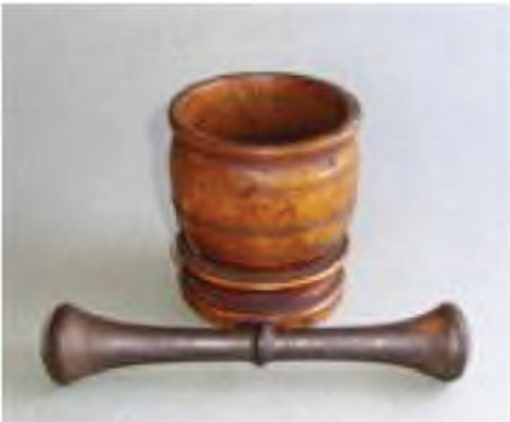
Fig. 4 – Mortar and pestle. Horn or ivory. 18/19 century. India. Dimensions: Mortar: Height: 9,4cm; Diameter: 8.6cm; Pestle: Length: 17,1cm; Diameter: 3,3cm. Biscainhos Museum Inventory Nr. 495 (a, b) MB.

Fig. 4a- Mortar and pestle. Horn or ivory. 17th/18th century. India. Dimensions. Mortar: Height: 11cm; Diameter: 8.5cm; Pestle: 18cm; Biscainhos Museum Inventory