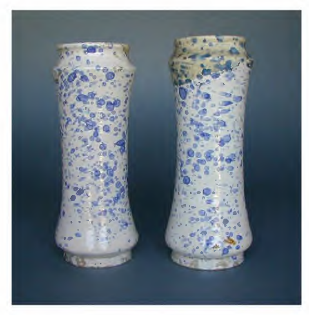
Fig. 5 – Pair cf glazed earthenware albarellos with blue sponge decoration on a white background. Dimensions: Height: 28.6 to 29.3cm; Diameter: mouth: 9.2 cm. 18th century (?) Biscainhos Museum Inv. Nr. 728 (a, b). MB.

Sponge decoration of Spanish albarellos in hospitals from Madrid and Alcala de Henares, ruled by Benedictine, Augustinian, Franciscan and Carmelite Orders and Monastic Orders in Spain, also appeared from the end of the 18th century [8 p350].