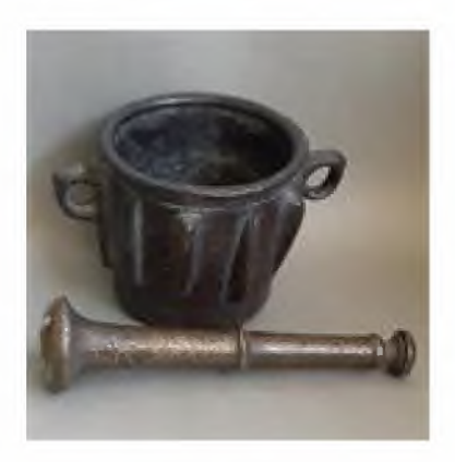
Fig. 3 – Mortal and pestle from the Middle Ages (?). Bronze. Provenance: Iberian Peninsula. Dimensions: Height: 9.0 cm. Biscainhos Museum. Inventory Nr. 482MB.

Fig. 3a – Bonze mortar and pestle. Bronze alloy. Bronze alloy. Dimensions: Mortar: Height: 8.8cm; Width: 15.2cm; Diameter: 4.5cm. Pestle: Length: 17.5cm. 15th (?) / 16th century (?). Biscainhos Museum Inv. Nr. 4182 (a, b) MB.