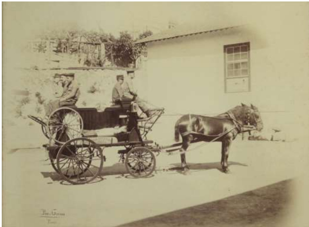
Figure 6-Photograph of patient being transported in an animal-drawn carriage by five salvation corps staff [MS.02950].

Concern about the public health problems occurring in Oporto, and the potential risk of their spreading throughout national territory had led the Government to demand that all civilian governors in the country strictly comply with sanitary provisions. However, certain elements of the national and foreign press were critical of the situation in Oporto (33-35) .