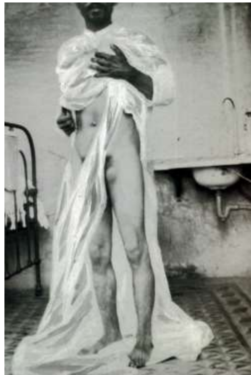
Figure 2-Patient with bubo in the left groin. Unidentified author. In: Paul-Louis Simond "La peste, ses causes et ses remèdes", Le Mouvement Thérapeutique et médical, N°6. Juin 1901.

Of the seventeen cases of which Ricardo Jorge was then aware, and had observed with the symptomatology and evolution that raised no doubt as to the nature of the disease, six had died. In addition, there were other patients who, because they had revealed suspicious symptoms or who simply known about by information from third parties, were awaiting further study. Thus, on 9 July, Ricardo Jorge was fully convinced that the clinical picture indicated bubonic plague. This information was reiterated in two reports sent (on 12 and 28 July) to the city authorities and the Government, along with a critical analysis of the living, working and social circumstances that had favoured the spread of the epidemic in the city (9) .