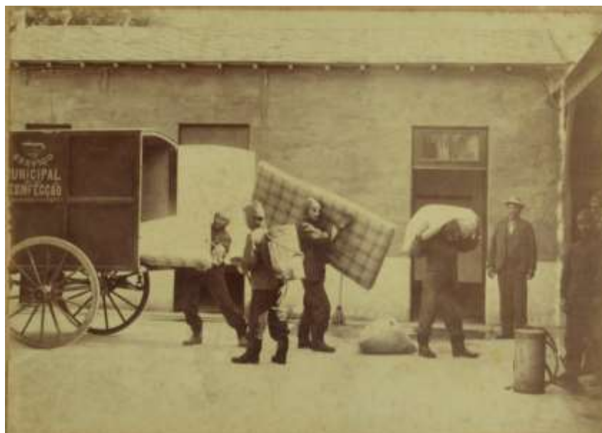
Figure 5-Municipal disinfection service car with a special corporation of fire brigade disinfecting mattresses with disinfectant spray as they are removed from the vehicle. [MS.02952].