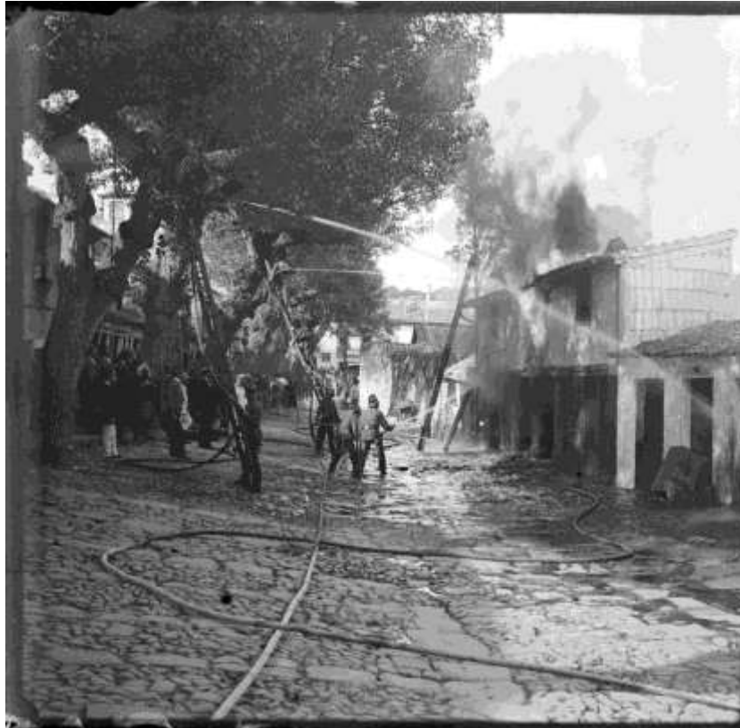
Figure 4-Incineration by firefighters of houses contaminated by the plague, in an "island" of Oporto. Author: Aurélio da Paz dos Reis. Courtesy: Centro Português de Fotografia.

current public health and legal provisions, demolition or upgrading of buildings as well as buildings harmful to public hygiene. Precautions against the epidemic were extended to all districts of the country, hoping to prevent the spread of the epidemic (32).