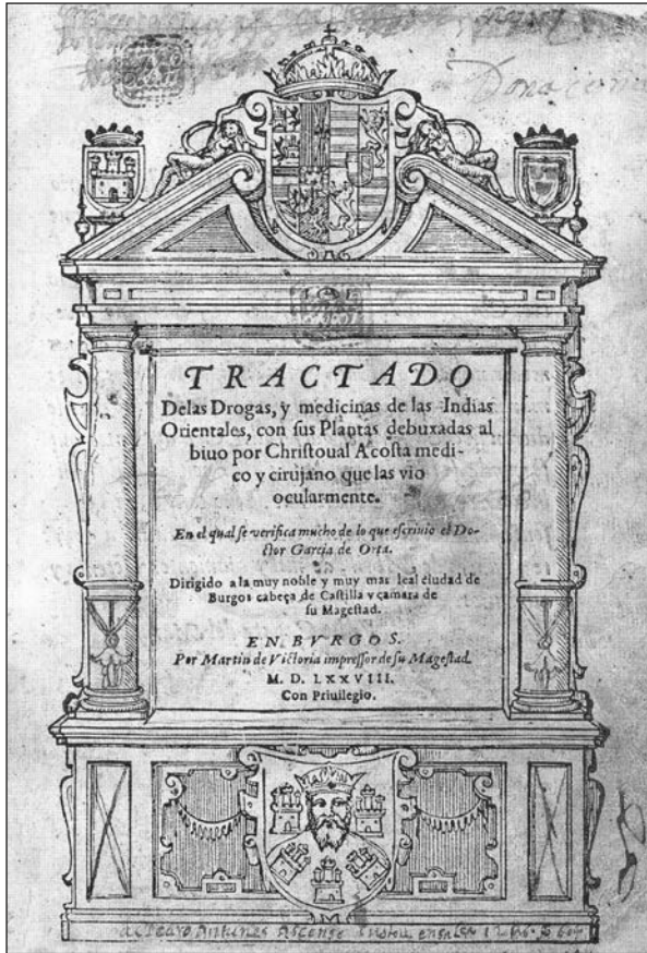
Figure 4 - Cristobal Acosta, 1578 title page. Library of the Faculty of Medicine, University of Lisbon