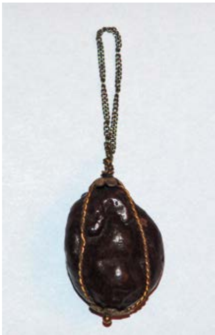
Fig. 7 - Oriental bezoar stone pendant, attached to a golden chain. 17 th century. Size: height: 6.4 cm, diameter 3.8 cm. Távora Sequeira Pinto Collection (Oporto)

Slika 7 – Privjesak s istočnjačkim bezoarom na zlatnom lancu. 17. stoljeće. Dimenzije: visina 6,4 cm, promjer 3,8 cm. Kolekcija Távora Sequeira Pinto (Oporto)