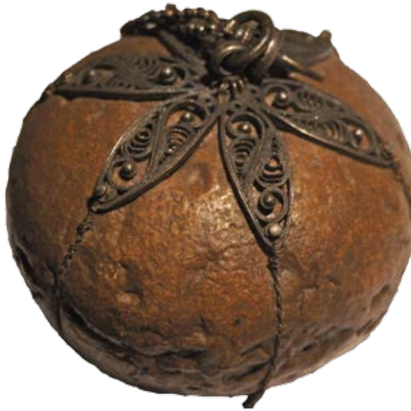
Fig. 6 - Oriental bezoar mounted on Indo-Portuguese golden filigree pendant in the form of a fruit. 17 th century. Size: height: 5.8 cm, diameter 8 cm. Távora Sequeira Pinto Collection (Oporto).

Slika 6 – Istočnjački bezoar na indo-portugalskom zlatnom filigranskom privjesku u obliku voća iz 17. stoljeća. Dimenzije: visina 5,8 cm, promjer 8 cm. Kolekcija Távora Sequeira Pinto (Oporto)