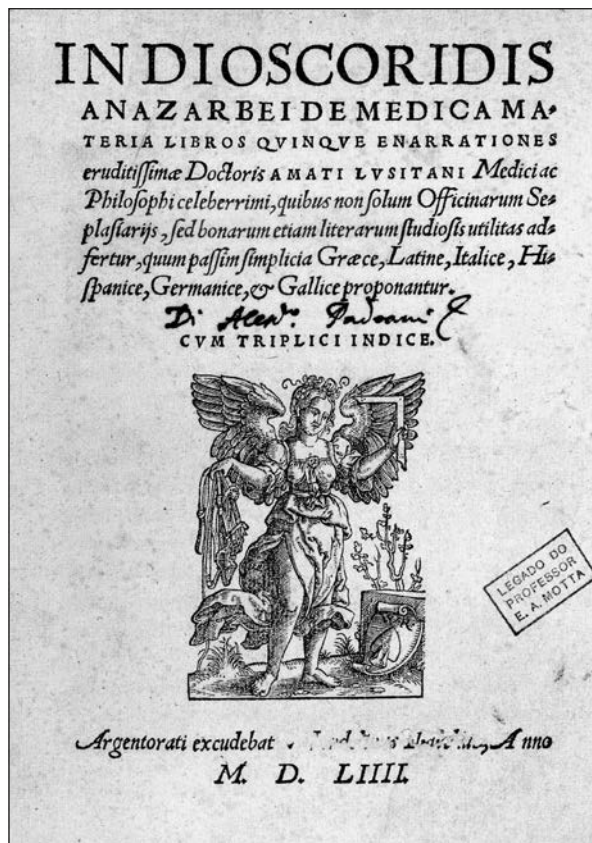
Figure 3 - Amatus Lusitanus. 1553 title page. Library of the Faculty of Medicine, University of Lisbon. (47)

Slika 3 – Amatus Lusitanus, naslovnica iz 1553. Knjižnica Medicinskog fakulteta Sveučilišta u Lisabonu (47)