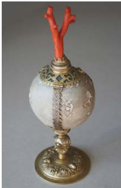
Fig. 8 – Oriental bezoar stone mounted on a golden filigree stand, decorated with a coral branch on the top. 18 th century. Size: height 25.6 cm, diameter 9 cm. Távora Sequeira Pinto Collection (Oporto)

Slika 7 – Privjesak s istočnjačkim bezoarom na zlatnom lancu. 17. stoljeće. Dimenzije: visina 6,4 cm, promjer 3,8 cm. Kolekcija Távora Sequeira Pinto (Oporto)