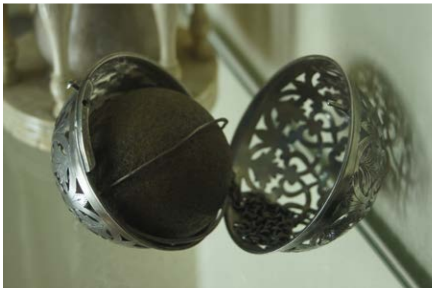
Fig. 9 – Spherical oriental bezoar within a silver Indo-Portuguese filigree container. 17th century. Size: diameter of bezoar 6,5 cm; diameter of the container 9 cm. Távora Sequeira Pinto Collection (Oporto).

Slika 9 – Okrugli istočnjački bezoar u indo-portugalskoj srebrnoj filigranskoj kutijici iz 17. stoljeća. Dimenzije: promjer bezoara 6,5 cm, promjer kutijice 9 cm. Kolekcija Távora Sequeira Pinto (Oporto).