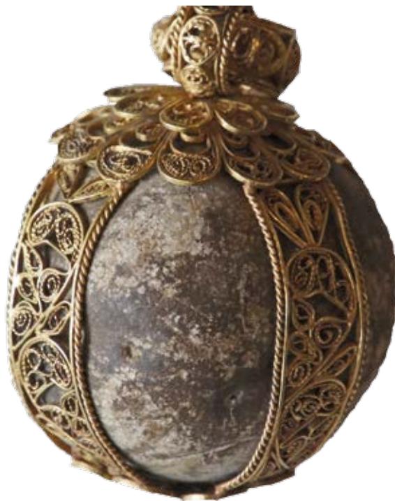
Figure 5 - Oriental bezoar mounted on Indo-Portuguese golden filigree pendant. 16 th century. Size: height 9.4 cm, diameter 6.1 cm. Távora Sequeira Pinto Collection (Oporto)

Slika 5 – Istočnjački bezoar na indo-portugalskom filigranskom privjesku iz 16. stoljeća. Dimenzije: visina 9,4 cm, promjer 6,1 cm. Kolekcija Távora Sequeira Pinto (Oporto)